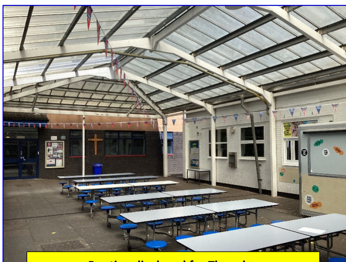
Bunting displayed for Thursday

FREE SCHOOL MEALS MEAL DEAL - 1 MAIN & DESSERT £2.55