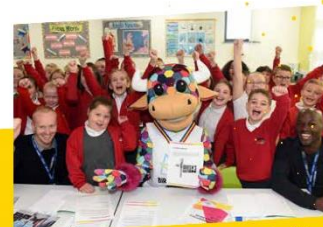
Pupils from West Heath Primary School learning about the Games through our classroom resources