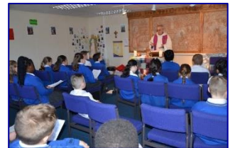
Maryvale Primary School